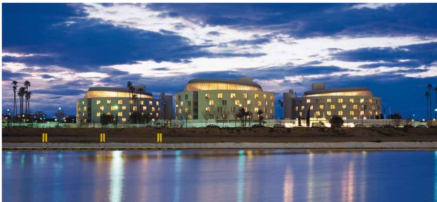
The venue at night: Hotel Barceló Renacimiento, Seville